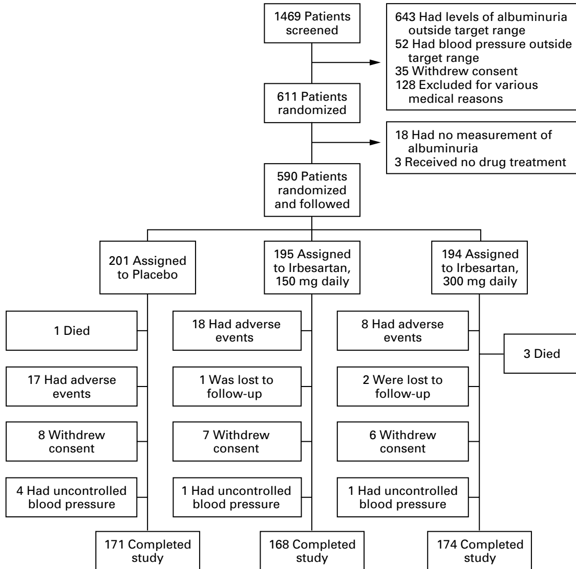
Figure 1. Profile of the Trial.

All 590 patients who underwent randomization and follow-up were included in the intention-to-treat analyses.